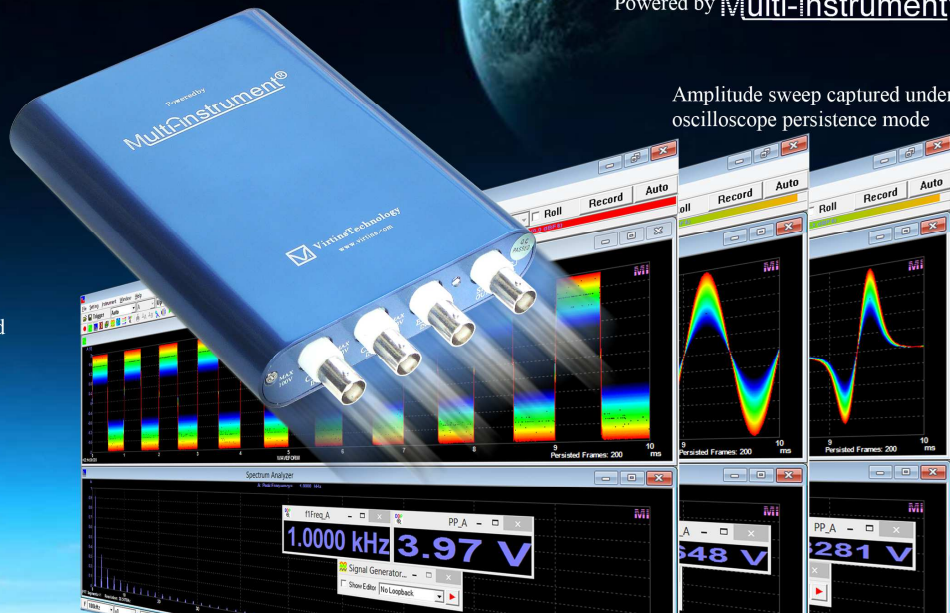
Amplitude sweep captured under oscilloscope persistence mode